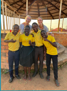
St. Andrea School Students