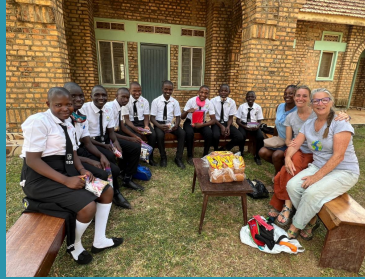
St. Edward's Students