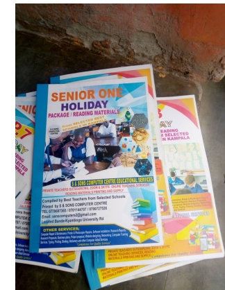
More workbooks to help the students maintain their studies.