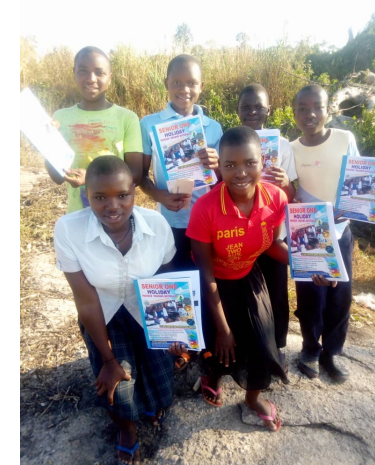
Secondary Students with their workbooks during the COVID-19 shut down of Uganda.