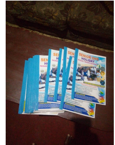
Secondary School Workbooks provided by RBG.